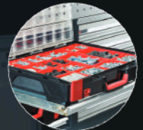
2 System case: can be pulled out completely and stacked together with other system cases