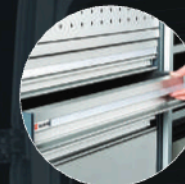
3 Drawers with labels: open quickly along the entire width