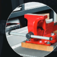
7 The workbench always travels along: space-saving solution that can be pulled out and secured in just a few simple steps