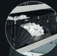
1 Storage bin shelves with patented front flap: for clear storage and easy access to small parts