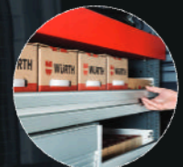
4 Shelves with hinge flaps: open with a simple movement