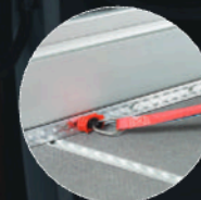
5 Clip-on tensioning belts: for loads that are safely secured